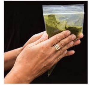
Reseal cone and massage contents until smooth.