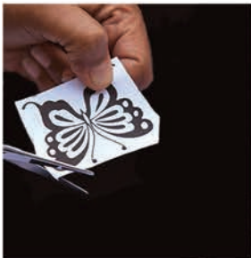
See Stencil Transfer Instructions on reverse side.