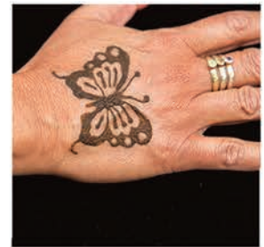
Drying will take 20–30 minutes, depending on design. Paste will dry flat and stick to skin. WAIT SIX HOURS before peeling henna off.