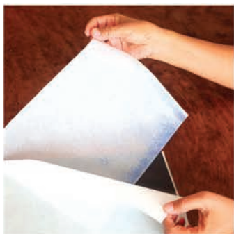
Remove protective tissue.