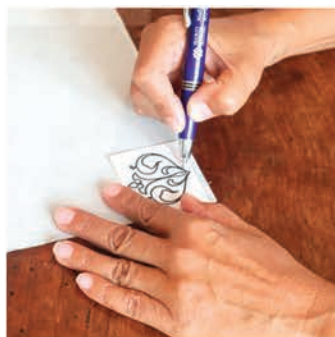
Trace stencil on top of Master Sheet.