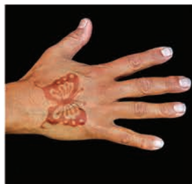
Wait 24–48 hours for rich, reddish-brown color to develop.