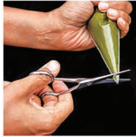
Using scissors, make a small cut at tip of cone.