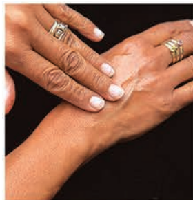
Wet skin with water.