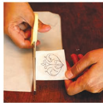
Cut design from sheet to apply to skin.