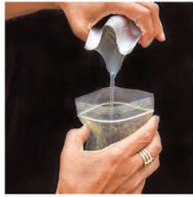
Pour contents of Solution packet into cone bag (BOTH packets if you have a premium kit).