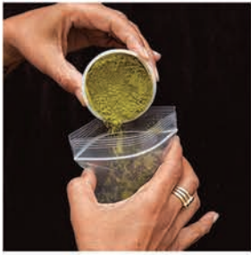
Pour henna powder into plastic cone bag.