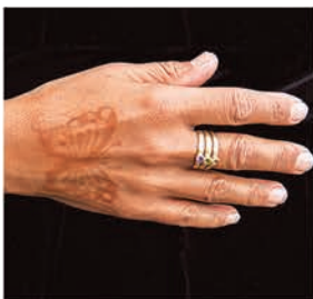
You will see very little color when you remove the paste. THIS IS NORMAL.