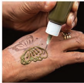
Slowly trace stencil outline with henna paste by squeezing applicator bottle.